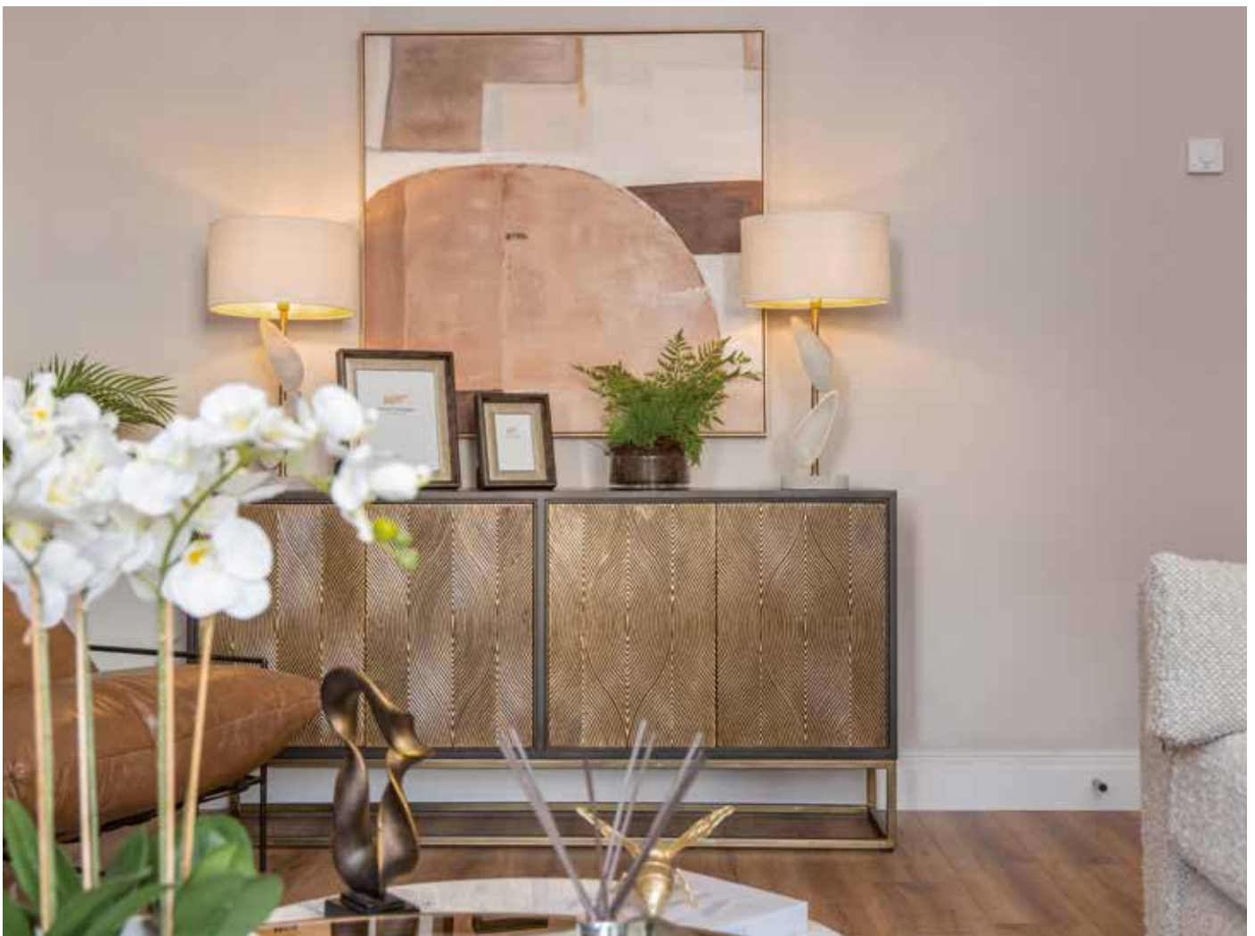
All images from Braidwater show homes